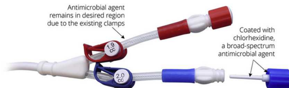
Figure 1 Antimicrobial barrier cap (ClearGuard™ HD) used in the chlorhexidine group.

The chlorhexidine-coated CVC caps used were ClearGuard HD Antimicrobial Barrier Caps (ICU Medical, San Clemente, CA, USA), which are equipped with chlorhexidine-coated cap threads and a chlorhexidine-coated rod that extends into the hemodialysis catheter hub (Figure 1). Therefore, attaching the cap to the dialysis catheter hub results in the local dissolution of concentrated chlorhexidine within the lock solution between the tubing clamp and the cap. The chlorhexidine-coated CVC cap was removed from the catheter at the time of dialysis and discarded. The dialysis catheter hub was then cleaned with an alcohol wipe. The lock solution was aspirated until 5 mL of